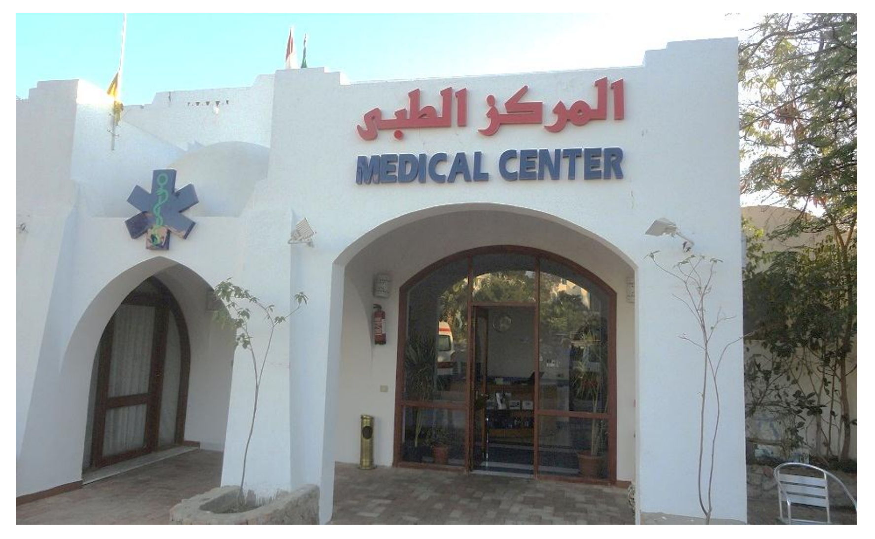
Fully equipped Medical Centre - All specialties are included