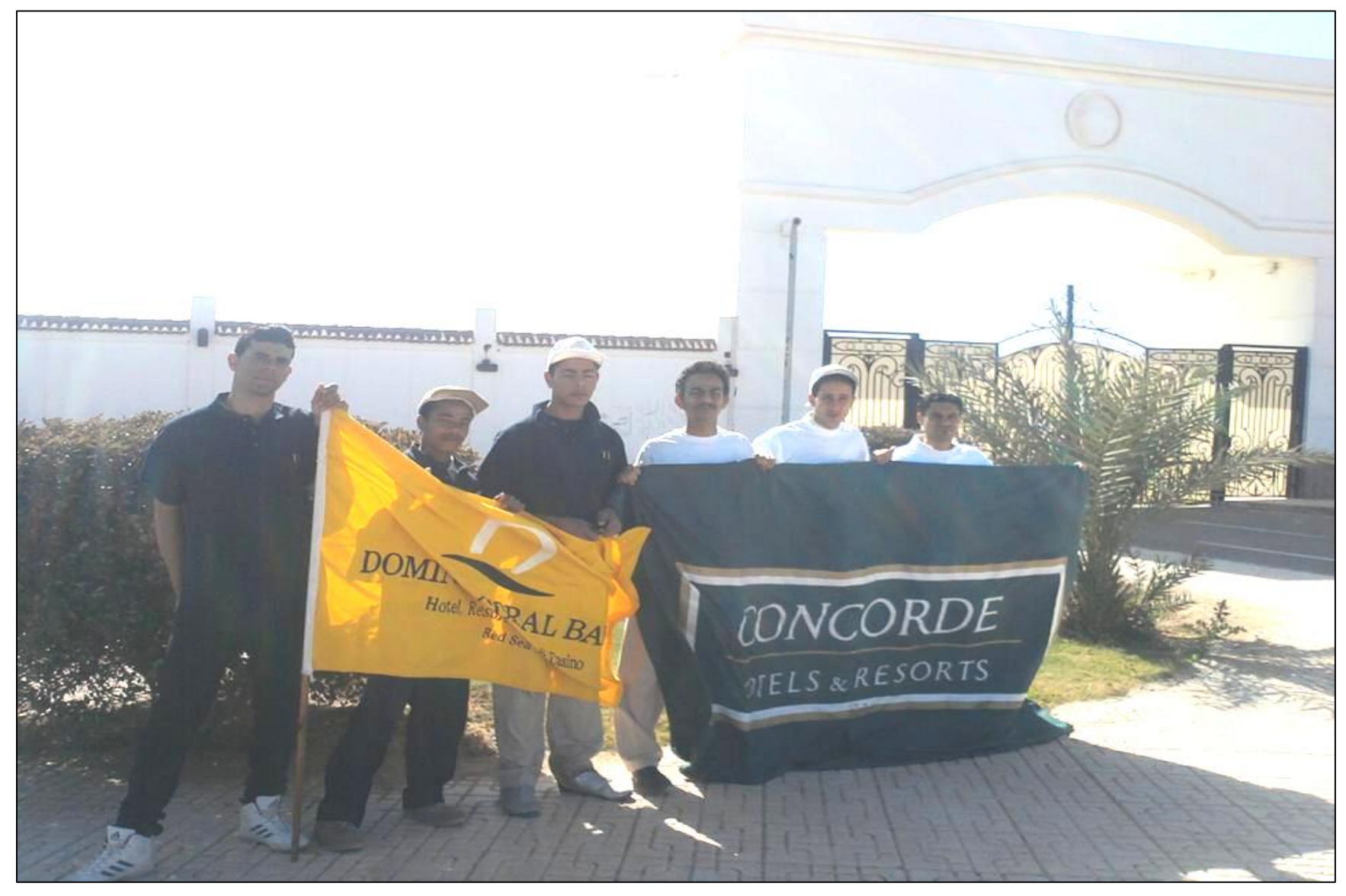
We always participate in any community service or activities Sharm El-Sheikh Clean-up Day – Aug 2014