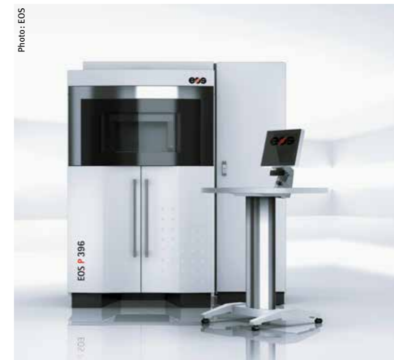
EOS P 396 plastic system for additive manufacturing.

Despite the apparent confusion, though, there is a plan. Priority has been given to terminology and general principles, which will provide the bedrock for the development of any future standards. When asked where all this is going, Boivie muses, “The use of the AM terminology standard in an open-information database will do a lot to spread the operative ‘word’ and give the industry a common voice.” What was once considered science fiction – the ability to produce objects on demand – is in the process of becoming a reality. AM is an enabling technology that makes it possible to produce parts that may not have been feasible or realistic in the past, creating endless possibilities for innovation. So although it is hardly possible to foresee where this technology is taking us, we know our three-dimensional future is looking bright. And with standards in the offing, let’s wager that AM will soon become an industrial strength, improving the way we live our lives. SANDRINE TRANCHARD AND VIVIENNE ROJAS