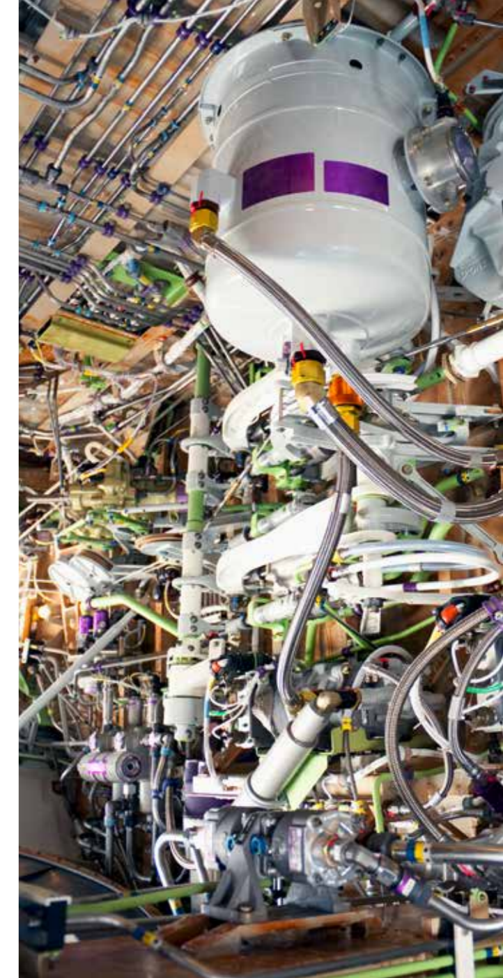
A detailed insider look at a turbo jet engine.

It has become essential to make standards uniform and consistent.