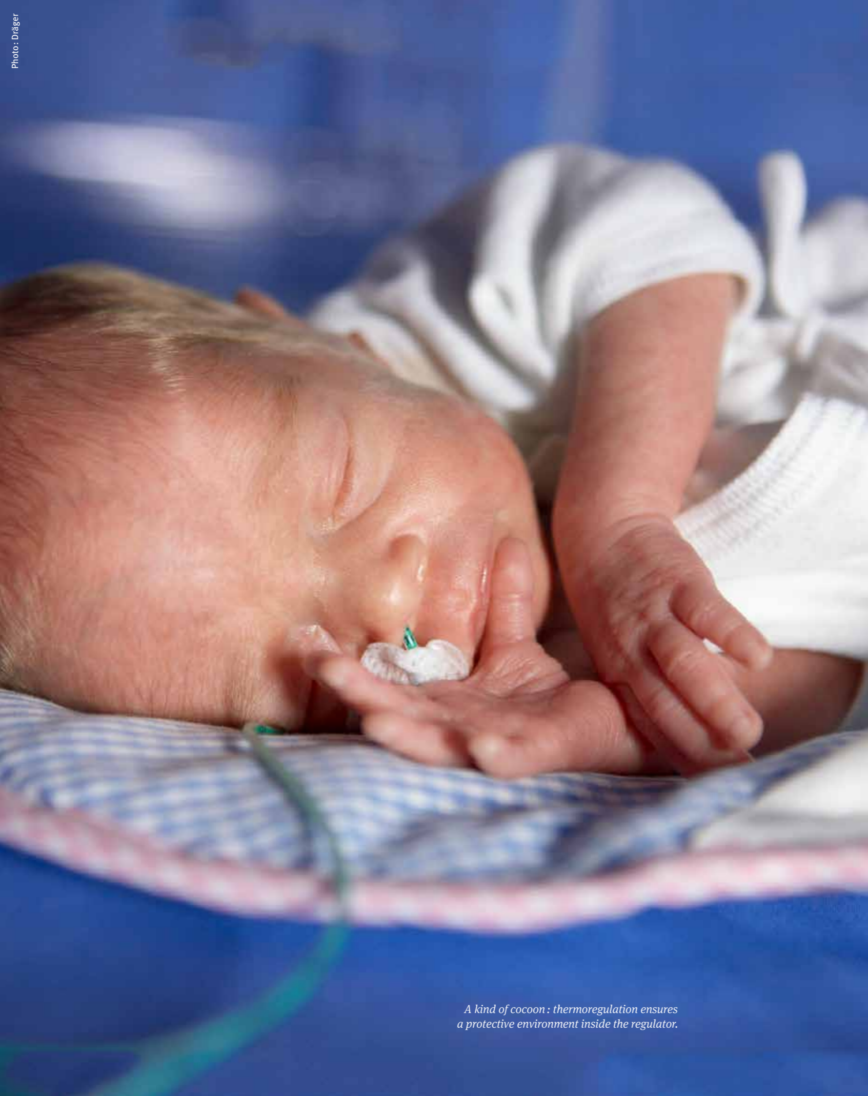
A kind of cocoon : thermoregulation ensures a protective environment inside the regulator.